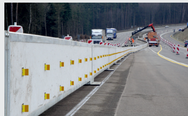
ProTec systems warrant a generous water drainage opening of 8m in length per 10m element.