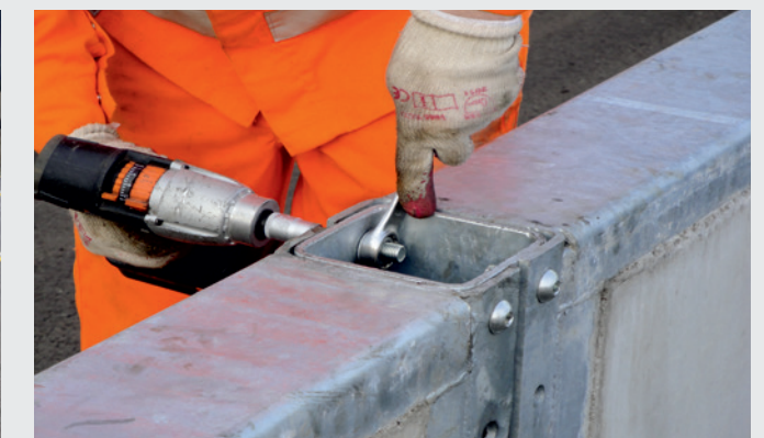
A stand is always fitted to every element. Just two screws are used every 10 meters.